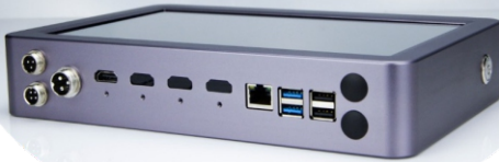
10 inch Touch Screen