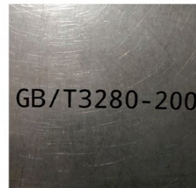
HD bold font