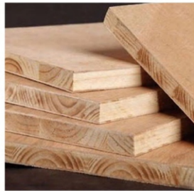
Furniture and wood