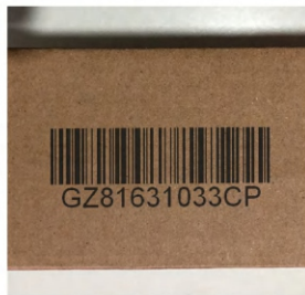
Dynamic security barcode