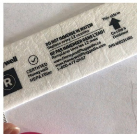
Multi- group printing